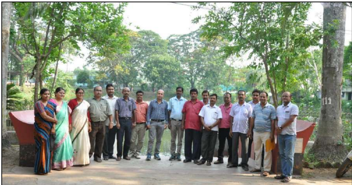
Teaching and Non Teaching friends