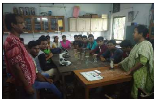
Biological Science Laboratories