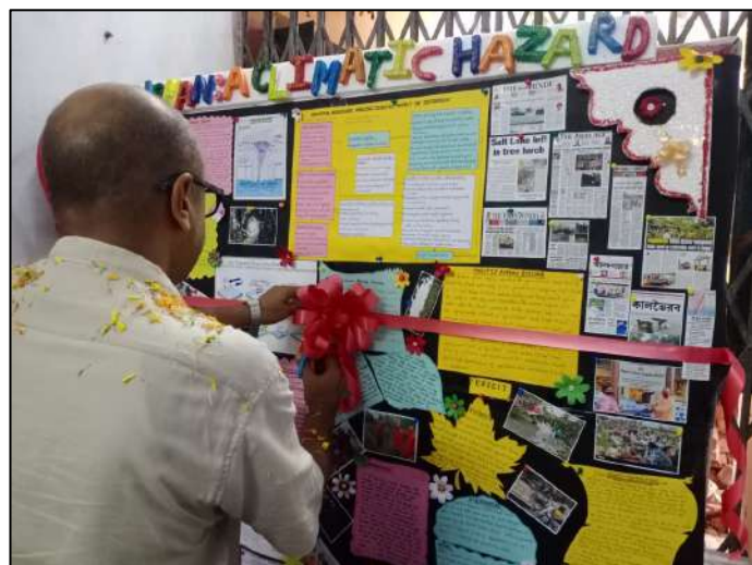
Department of Geography