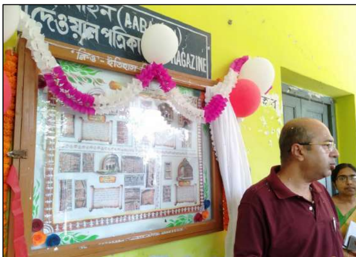
Department of History