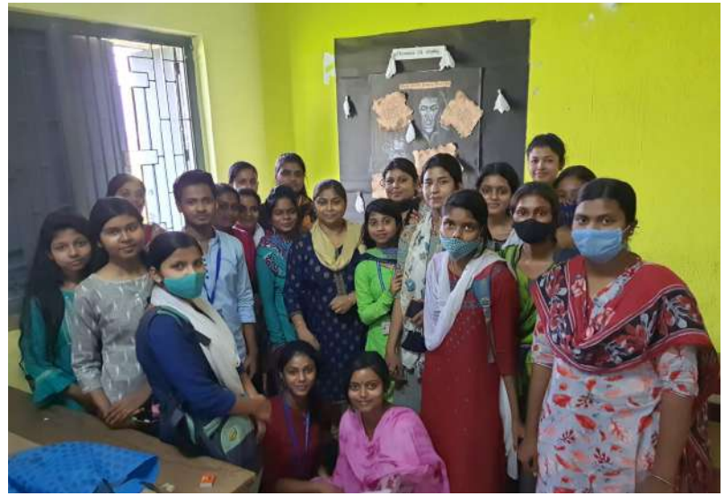
Department of English